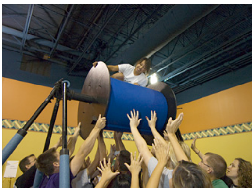
Interns compete at a team challenge during E&Y's annual leadership conference.

Opportunities in a wide range of areas, including finance, taxes, supply chain, customer, strategic direction and program management; IT, people and organizational change consulting. Skills in demand include finance transformation, business performance management, procurement, logistics, pricing as well as Oracle, SAP, Hyperion and other technology platforms and tools. Experience in restructuring, valuation, transaction integration and transaction tax also is in sought.