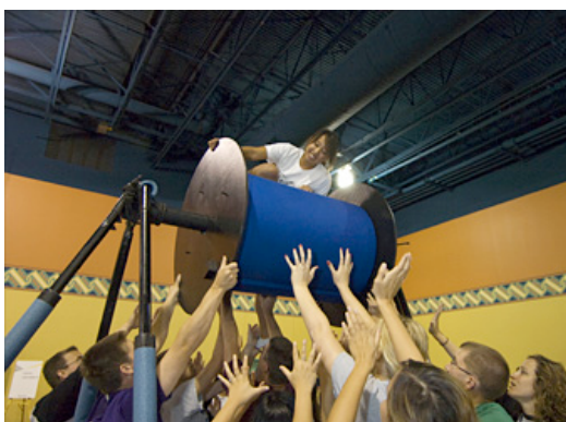
Interns compete at a team challenge during E&Y's annual leadership conference.

Opportunities in a wide range of areas, including finance, taxes, supply chain, customer, strategic direction and program management; IT, people and organizational change consulting. Skills in demand include finance transformation, business performance management, procurement, logistics, pricing as well as Oracle, SAP, Hyperion and other technology platforms and tools. Experience in restructuring, valuation, transaction integration and transaction tax also is in sought.